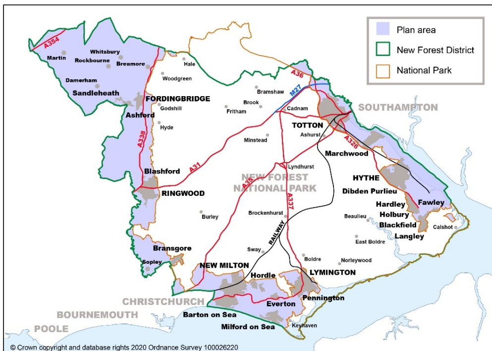
Figure 1: The Plan Area

1.5 The SPD covers proposed developments within the New Forest District (outside the National Park) Local Plan Area, shown in the figure below, however the area covered by the relevant assessment may extend beyond the New Forest District local plan area.